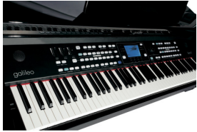
Incredible Features, Elegant Design