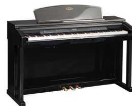
Milano II in Ebony Polish