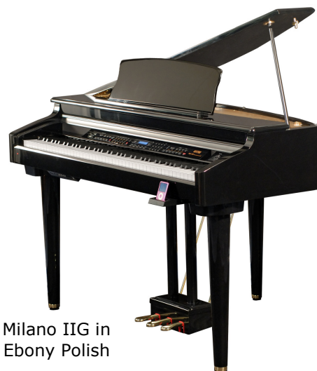
Milano IIG in Ebony Polish

The Milano II by Galileo combines advanced piano technologies with an iPod Dock, USB, SD Card and full-ensemble features—at an ultra-affordable price! Designed to meet the high standards of European tradition, the Milano II is an ideal instrument for music education, performance and entertainment. The Milano II is loaded with features including a palette of 138 built-in sounds and 100 different rhythm styles. You can add 'intros', 'endings' and 'fills' as well as record your own compositions on the built-in Multi-track sequencer. The graded-hammer action keyboard simulates the mechanics of an acoustic piano to help develop finger agility. There's a USB-computer connection & SD Card drive for recording and playback as well as an iPod® Dock! All functions are easily displayed in a large back-lit LCD display screen. The beautiful designed dark rosewood and ebony polish cabinets feature elegant acoustic-piano styling and matching piano bench. The Milano II by Galileo - Maximum features at an affordable price!