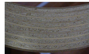
Close-up of 19-ply Wood Rim